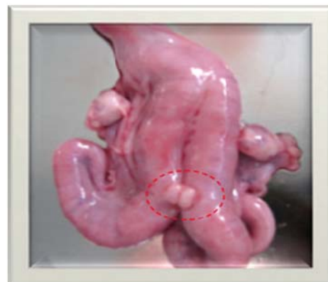
Figure 9. Adverse effect of surgical embryo collection - Protrusion of the endometrial lining through the wound at the site of catheter insertion.