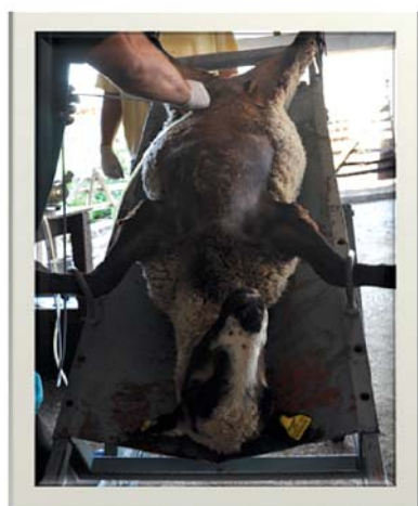
Figure 4. Positioning of the animal in a supine head-down (Trendelenburg) position for laparoscopy

Investigating ovarian macrostructures during the periovulatory periods some authors reported (22) that for precise estimation the use of both methods: ultrasonography and laparoscopy is necessary. Transrectal ultrasonography enables precise estimation of the ovarian size and diameter of follicles and CL's. However, ultrasound examination is less accurate for determination of number of ovarian structures then laparoscopy: 67 \pm 11\% , 50 \pm 12\% , 55 \pm 12\% , 60 \pm 10\% for growing follicles, ovulation, CL and Cysts, respectively.