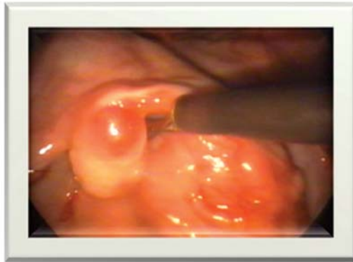
Figure 1. Preovulatory follicle on sheep ovary - laparoscopic view

servation of the ovaries (Fig. 1.) and uterus (Fig. 2.) of the ewe by means of an illuminated endoscope, inserted through an abdominal cannula”.