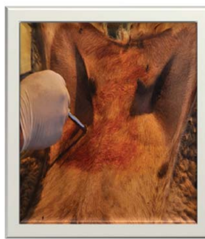
Figure 5. Typical insertion point of a trocar for laparoscopy