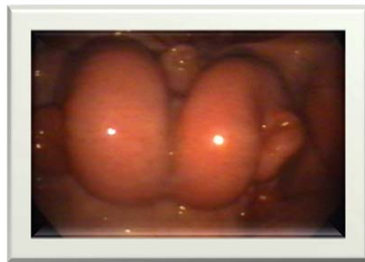
Figure 2. Laparoscopic view of a sheep uterus in estrus

With the introduction of video cameras and other ancillary instruments (Fig. 3.) laparoscopy rapidly advanced from being just a diagnostic pro-