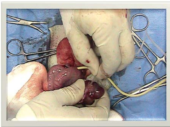
Figure 8. Flushing of embryos in ewes – surgical method

Procedure for laparoscopic embryo recovery is similar to the LAI, with using of three instruments: endoscope, forceps for holding uterine horn and a three-way balloon catheter for flushing of embryos (24). The major problems related to repeated superovulation and frequent oocyte or embryo collection procedures are adhesions caused by protrusions of the endometrium at the puncture site. However, similar problem have been recorded during embryo recovery by laparotomy (Fig. 8. and Fig. 9.).