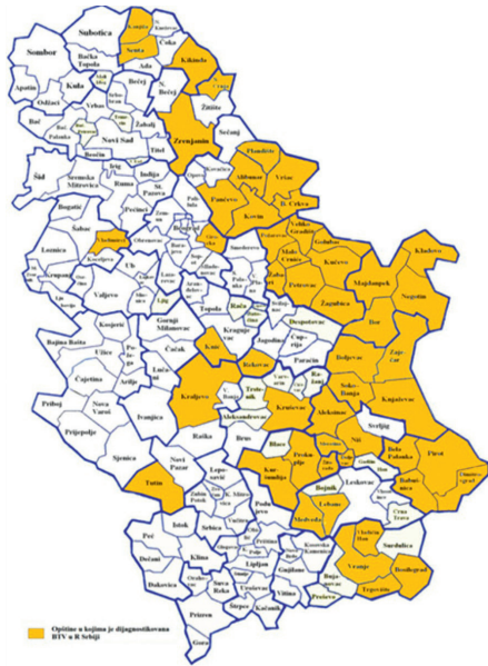
Figure 1. Distribution map of bluetongue cases in territories covered by veterinary institutes in Serbia in 2014

of BTV virus serotype 4 in 56.78% of seropositive samples. With regards to the total number of susceptible animals (1 484 725) kept in the areas of BTV outbreak recorded in 2014, the overall incidence proportion of BTV in Serbia reaches 0.16% (2 313 infected animals).