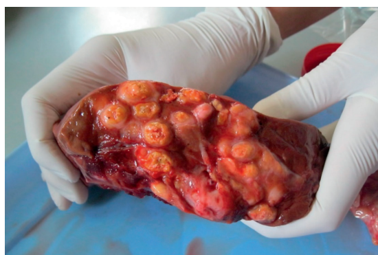
Figure 3. Multiple tubercles in lungs

The distribution of the visible lesions from the sampled animals is shown in Table 2 and the prevalence of visible lesions per organ in Table 3. The highest prevalence of tuberculous lesions in the lymph nodes was 47.47%, detected in MdLNs (CI 95%: 37.63-57.31%) and the lowest was 9.09%, detected in the MsLNs (CI 95%: 3.43-14.75%).