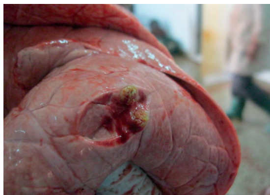
Figure 2. Tubercle in lungs