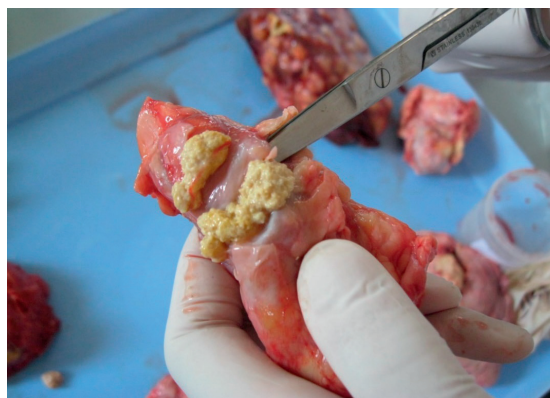
Figure 1. Caseous necrosis in a mediastinal lymph node

Typical tuberculous lesions (Fig. 1, 2 and 3) were detected in 62 animals (33%). Generalized bTB was diagnosed in 3 animals.