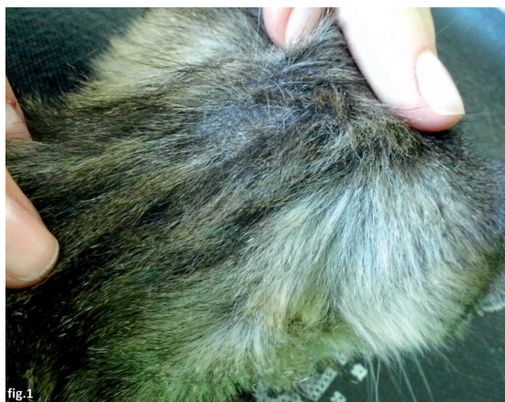
Figure 1. Alopecia, lichenified and thick skin on the neck

There were no symptoms from other body systems, and the cat had no previous history of such symptoms. Therapeutic trials (eight weeks) with a hypoallergenic diet (RC hypoallergenic) did not alter the pruritus or the gross appearance of the skin lesions. Glucocorticoids (prednisolone 2 mg/kg) resulted in a slight decrease of pruritus, but this reduction was not complete. Corticosteroids were discontinued before therapeutic trials with a hypoallergenic diet. Examination with a Wood's lamp, microscopic examination of the hair, skin scrapings, fecal examinations, and fungal cultures failed to reveal any infectious or parasitic agents. Flea bite hypersensitivity was excluded by appropriate anti-flea treatment. On microscopic examination of hair, broken hair shafts were found. No abnormalities were noted in the complete blood count, serum tests, or urinalysis. Ultrasound of abdomen and thorax radiography showed no