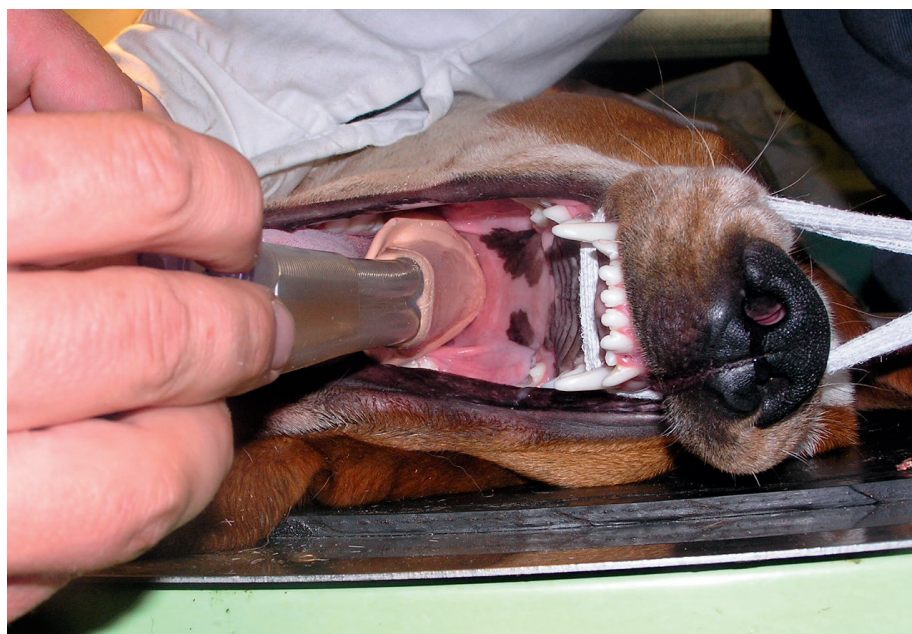
Figure 1. Insertion of LMA along the longitudinal axis of the oral, pharyngeal and laryngeal axis

The cLMA is a silicone tube with an elliptical soft silicone cuff. The inflatable outer cuff is connected to a pilot balloon, which is attached to the